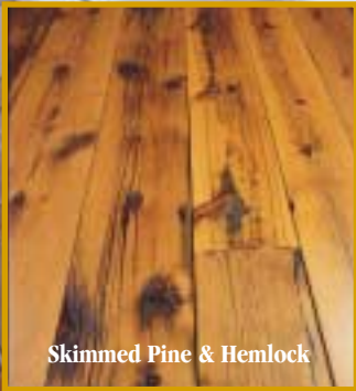
Skimmed Pine & Hemlock