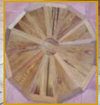
This custom inlaid medallion is just a sample of what you can do with our products.