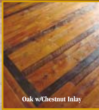
Oak w/Chestnut Inlay