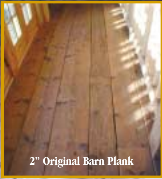
2" Original Barn Plank